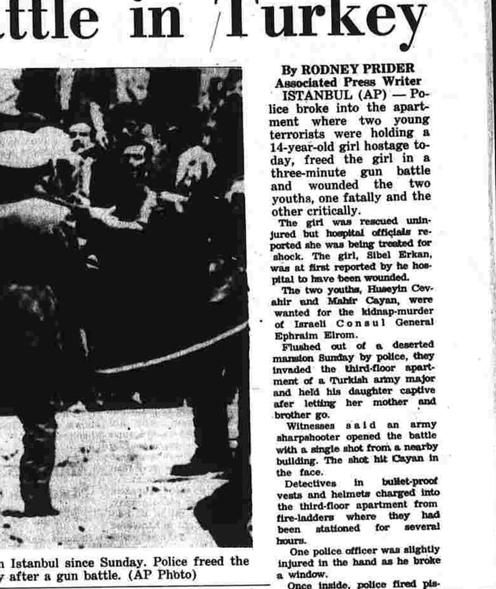
By RODNEY FRIDER Associated Press Writer ISTANBUL (AP) — Police broke into the apartment where two young boys were holding a 14-year-old girl hostage today, freed the girl in a three-minute gun battle and wounded the two youths, one fatally and the other critically.