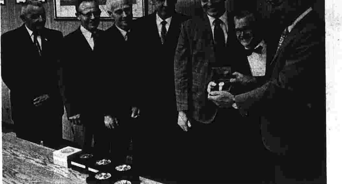
Seven employees of the Colonial Board and Lydall and Foulds Divisions of Lydall, Inc., who are observing 25th anniversaries with the company were honored yesterday at informal ceremonies.

LYDALL OMMITS DIVIDEND... Director of Lydall, Inc. of Manchester voted at their annual meeting Thursday to omit the regular dividend on the company's common stock but to declare a dividend for its preferred stock.